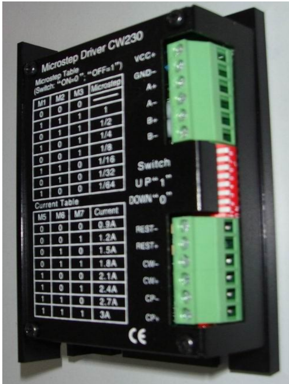
Photo for CW230

Address: hugang bridge, 312 national road, Qishuyan district, Changzhou city, Jiangsu Province, China. 213011